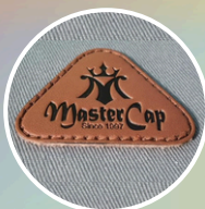
Faux leather patch